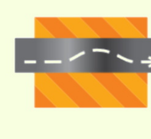
BROW OF A HILL